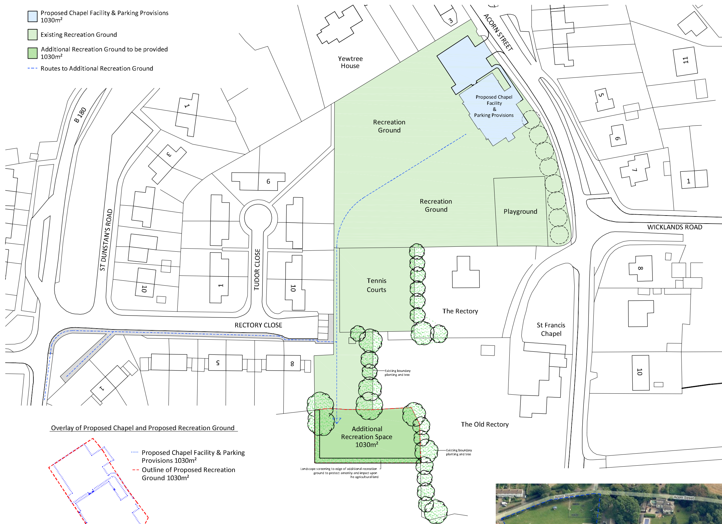
Overlay of Proposed Chapel and Proposed Recreation Ground